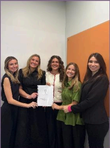
Created a 70-page campaign book and client presentation for my PR campaigns course