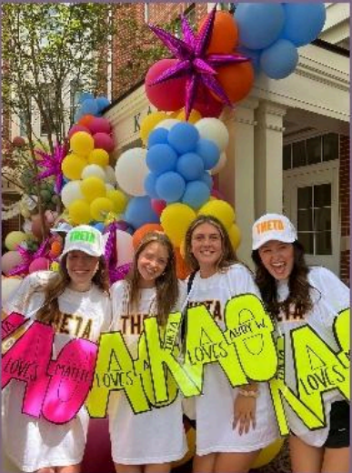
Member of Auburn University's Panhellenic, Kappa Alpha Theta