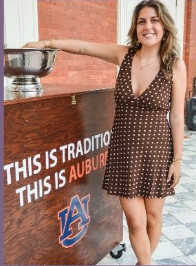
Earned my Auburn ring after completing 75 credit hours