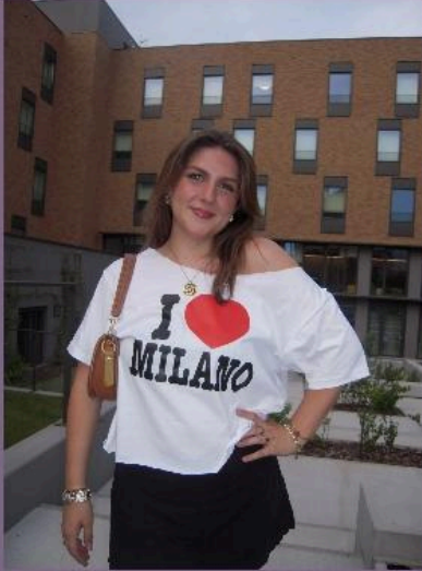
Studied Abroad in Milan, Italy