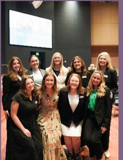
New Member Recruitment Chair of The Oaks Agency