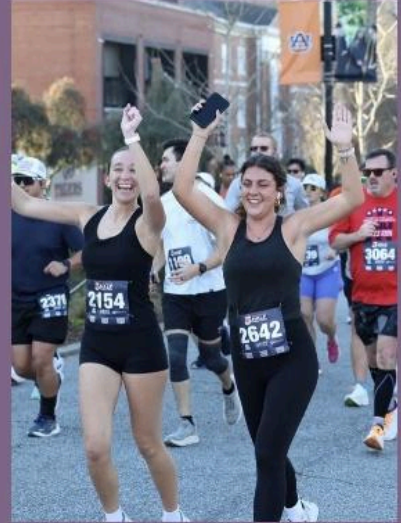
Ran my first half-marathon